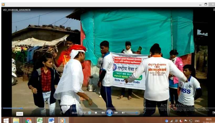
Street Plays on Save Energy at Adivasi Pada of adopted village Jite