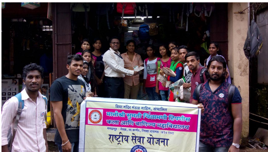
NSS Activity_ Distribution of paper bags in Neral market_ Social message of reducing use of Plastic bags