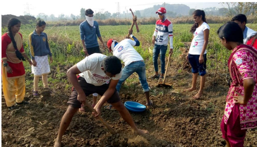
NSS_ Excavating Organic Pit (sendriya khadde)