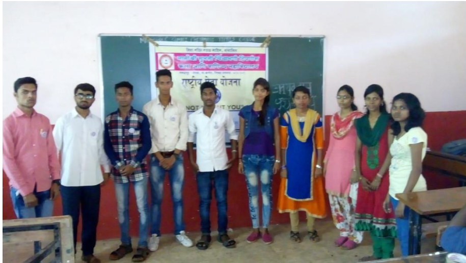
NSS_ 2nd Prize at District Level Organ Donation Awareness Programme Street Play Competition_ Anjuman Islam College, Murud Janjira.