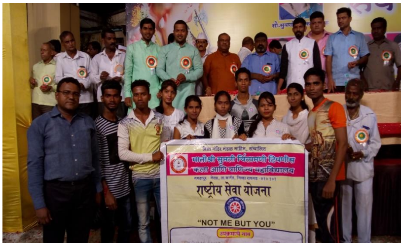
A photograph with Neral Grampanchayat at Ganesh Visarjan Ceremony

Students also participated during time of Ganesh Festival on the Visarjan Day (immersion of Lord Ganesha) to collect and to remove plastic bags carefully from the Nirmalya (flower tributes) deposited in Nirmalya Kalash. Plastic bags were given for recycling at Scrap Shop.